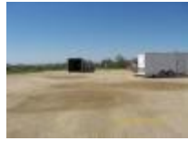
Sunday March 2 The storage units contents were sorted and the trash and old items were taken to the dumpster.